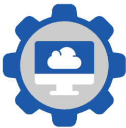
Cred-Secure REST API Cred-Secure Appliance

Between 15% and 40% of a typical company's credentials already exist in our database