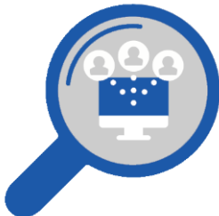
CredMonitor for Enterprise